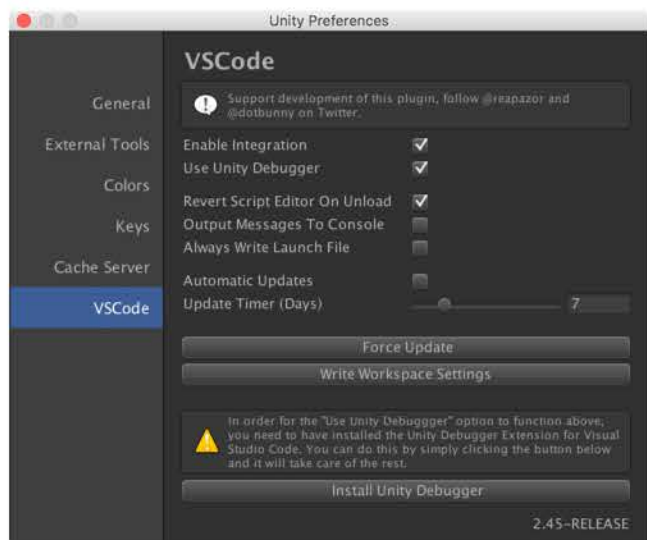
Unity Preferences Window

By default the integration is disabled, you will need to go into the Unity Preferences and go to the newly created VSCode tab.